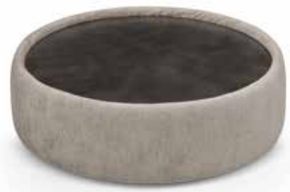
Cubic cm. ø 112x32