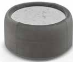
Cubic cm. ø 62x32