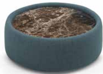
Cubic cm. ø 92x32